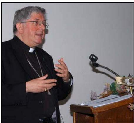
Archbishop Thomas Collins.