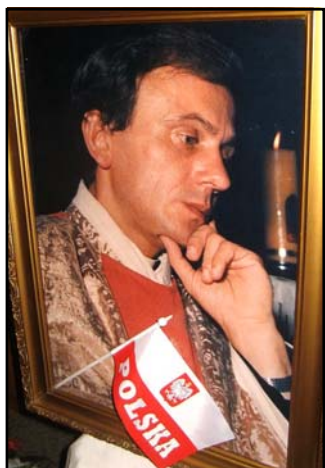
Fr. Jerzy Popieluszko