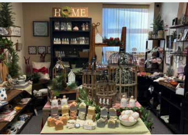
Treasures can be found in every corner of the 4 seasons gift shop. Visit us today at the Catholic Pastoral Centre!